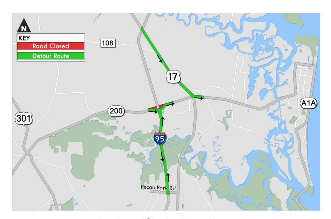
Eastbound SR 200 Detour Route

Stay informed about lane closures and roadwork in your area by following FDOT District 2 at @MyFDOT NEFL on Twitter or at MyFDOTNEFL on Facebook.